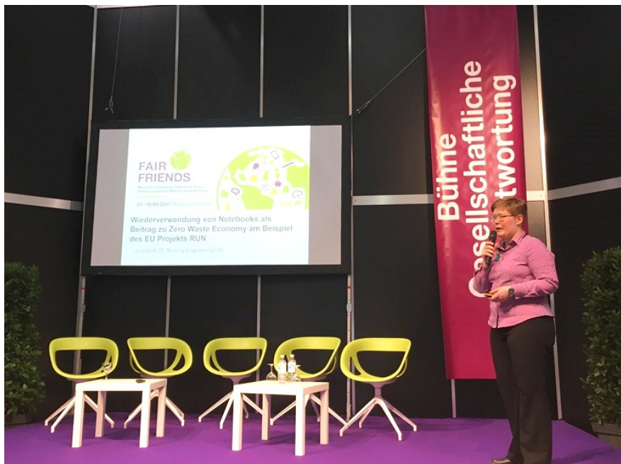
Figure 1: Presentation of RUN at Fair Friends 2017

Information about upcoming and past events is also available on the RUN website: